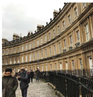
Royal Crescent, Bath Fabulous Georgian Architecture

I am not the only person who loves this place. In 2015 a Good Samaritan donated £1.5million to Bath Abbey in a plain brown envelope for essential renovations.